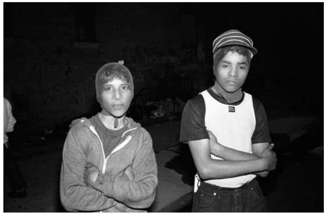
Two teens wear stocking masks to hide their identities, Bathgate Avenue, 1982.

When Stephen Shames took his first photos of the Bronx in 1977—while on assignment to produce a photo essay for Look —the area, one of the poorest in the United States, was a "terrifying" and "often dangerous" place. Heroin soon became easily available in the borough, followed by crack. And yet, Shames said, the Bronx felt like home.