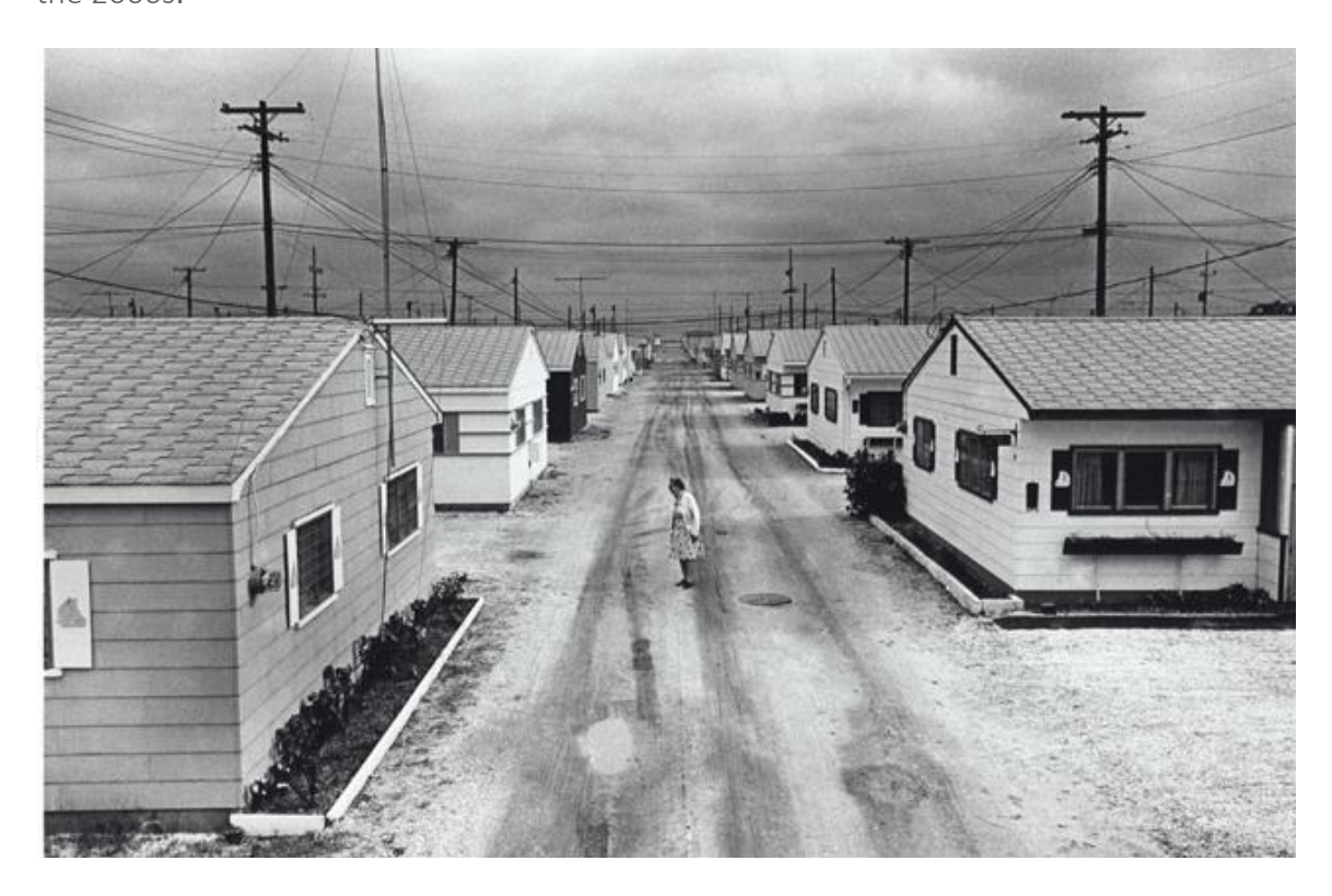
Woman at Beach, New Jersey Shore, Burk Uzzle, 1967. Vintage gelatin silver, 11 x 14".

As a photojournalist, Uzzle has produced some of the most recognizable images of Woodstock, the Civil Rights Movement, and the Cambodian War. But it is his artistic work that is the subject of the exhibition, Burk Uzzle: American Puzzles , at the <u>Steven Kasher Gallery</u>, New York, now through July 31, 2015. The exhibition features over 70 vintage black and white photographs of the American social landscape from the 1960s through the 2000s.