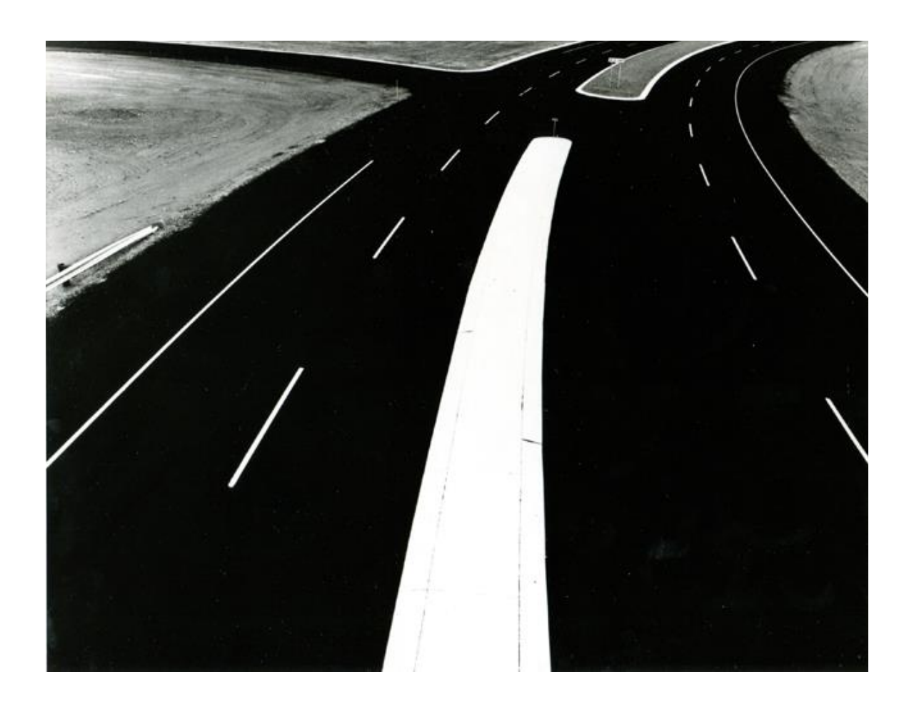
Brand New Highway, New Mexico, Burk Uzzle, 1970. Vintage gelatin silver, 8 x 10".

Uzzle, who identifies himself as a country boy, indicates that he believes in having fun with the camera. That fun is evident in American Puzzles as he challenges us to think outside the box when looking at images that are at once familiar and strange.