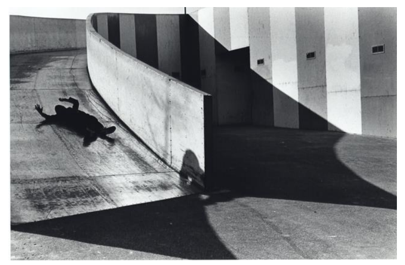
Park Slide, Washington, DC, Burk Uzzle, 1967. Gelatin silver print, 11 x 14".

Uzzle's photographs are graphic, bold, and visually complex, creating a visual meditation on the tensions of late twentieth-century America. These images are puzzles to be contemplated at length, asking questions about the nature of the individual and collective psyche in an increasingly post-industrial landscape. There is nothing sentimental in these images; instead they are challenging, and sometimes humorous, images that ask us to stop, look, and reflect.