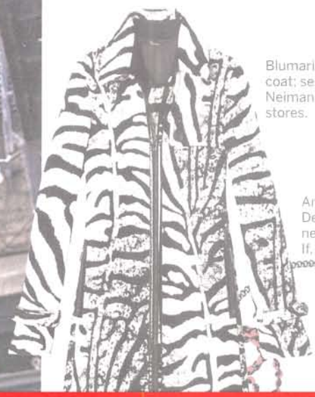
Blumarine coat; select Neiman Marcus stores.