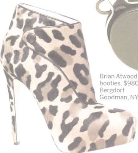
Brian Atwood booties, $980; Bergdorf Goodman, NYC.