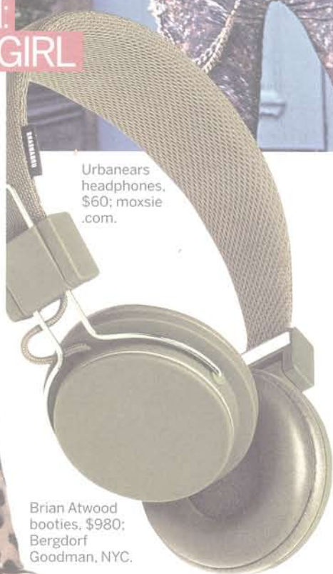
Urbanears headphones, $60; moxsie.com.