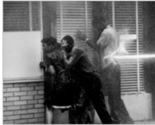
Demonstrators huddled in a doorway, seeking shelter from high-pressure fire hoses, in Birmingham, Ala., in 1963.