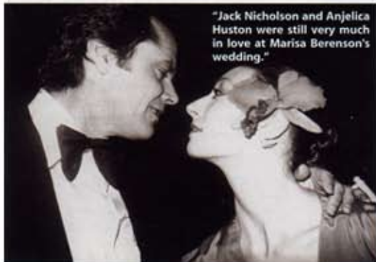
"Jack Nicholson and Anjelica Huston were still very much in love at Marisa Berenson's wedding."

The intention was to have the pictures give you the feeling of being at the party. That's why some are at skewed angles, or there's half a head or a hand in the corner of the frame. They're not the kind of shots you get today with people standing there with their drink smiling into the camera. It was before the paparazzi industry changed the nature of those pictures, when they were still spontaneous and you could catch a moment. What I was doing was much more candid than you would see today."—Bob Colacello