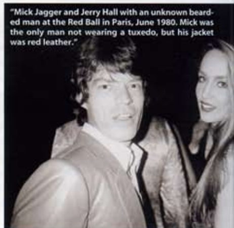
"Mick Jagger and Jerry Hall with an unknown bearded man at the Red Ball in Paris, June 1980. Mick was the only man not wearing a tuxedo, but his jacket was red leather."